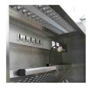
Configuration UV Light; Fluorescent Light; Adjustable Spotlight; Stainless Steel Hanger; "UV, FAN, LIGHT, PULVERIZER" Control.