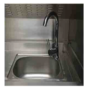
Water Tap & Sink Stainless steel; Whole-structure.