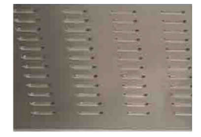
Suction Inlet Suction inlet adopts louver-type. The upper mouthing structure ensures above blower suction, avoiding air back-streaming.